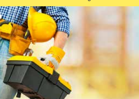
Facility & Maintenance