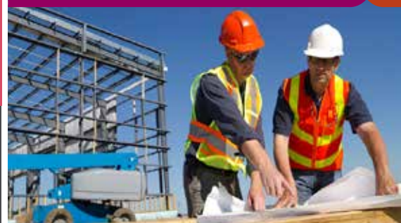
Engineering and Construction