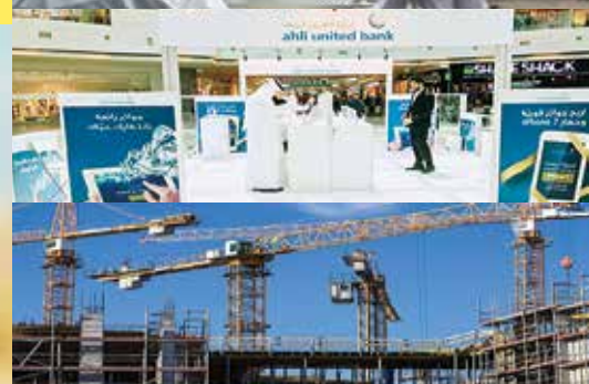
Sectors (Projects, Contract Specific or Services)