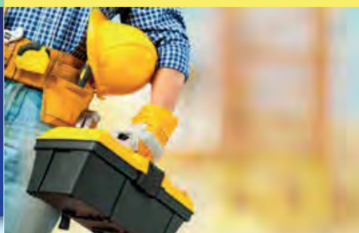
Facility & Maintenance