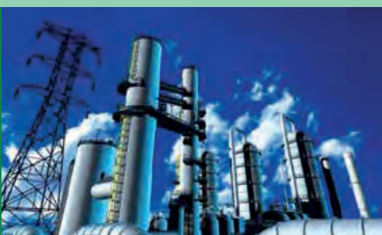
Oil & Gas, Petrochemical