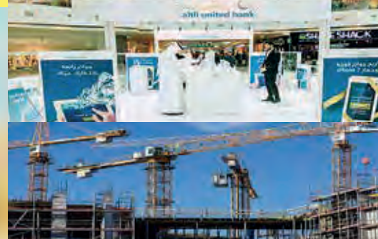
Sectors (Projects, Contract Specific or Services)