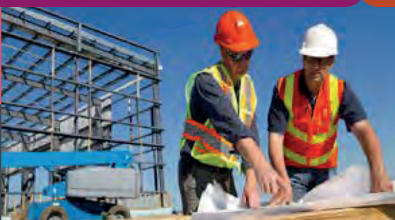
Engineering and Construction